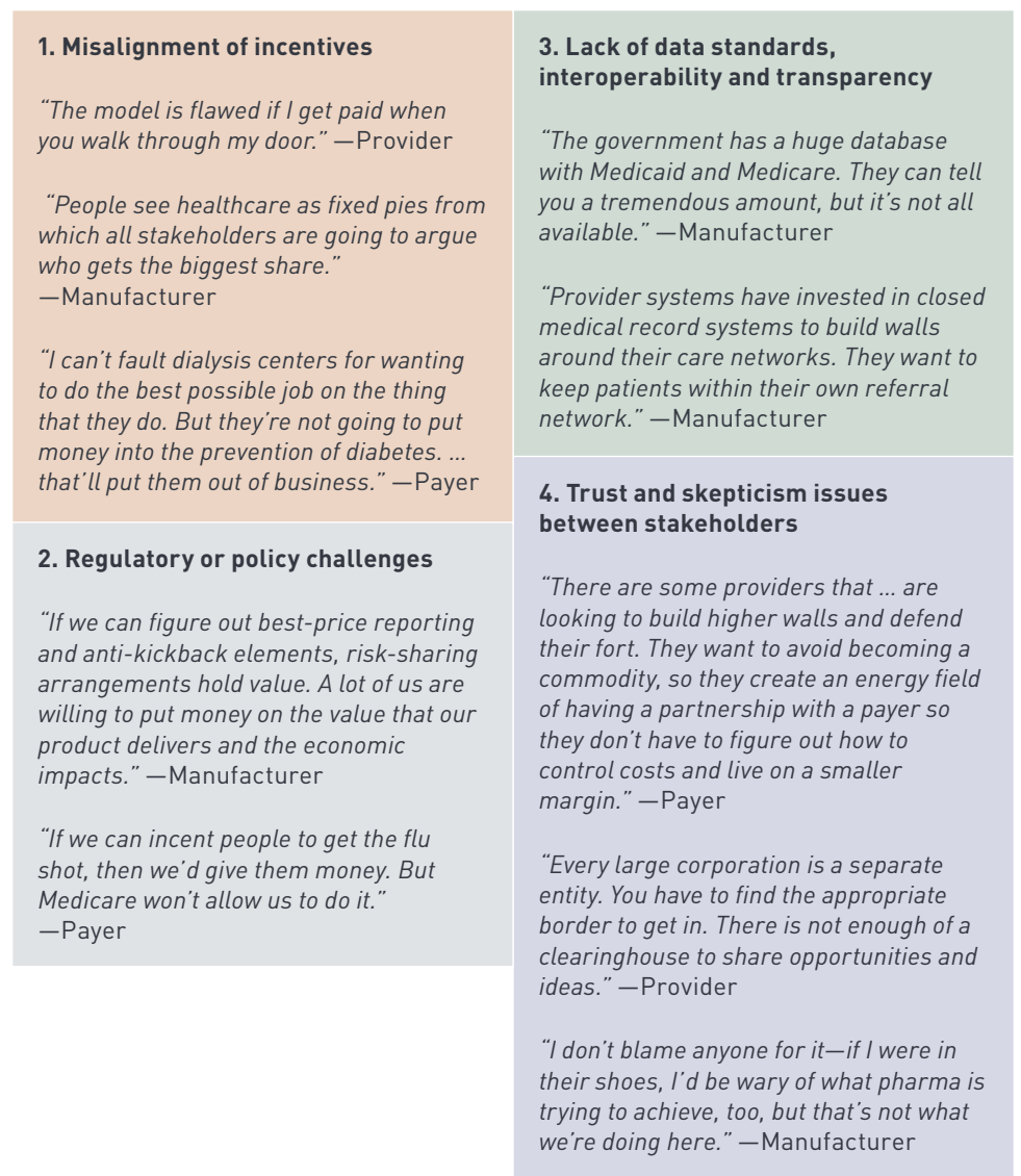
Figure 6: HLC Stakeholder Explanations of Barriers

Some of these barriers are expanded upon with interviewee commentary in Figure 6, below.