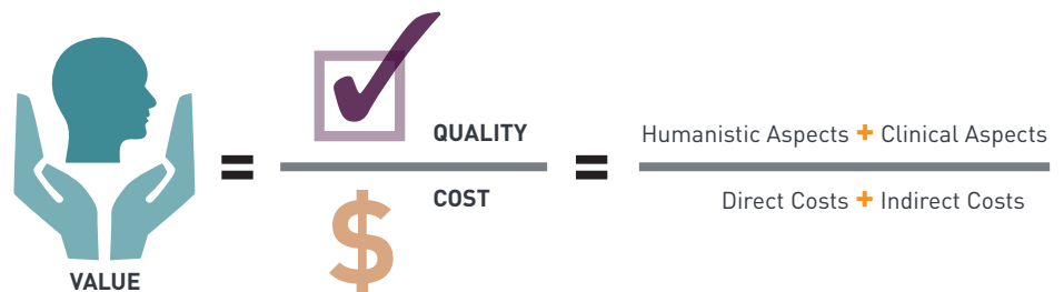
Figure 1: Value in Healthcare

Respondents noted that in the case of healthcare, in today's climate, it is imperative to simultaneously raise quality while lowering (or at least stabilizing) cost. It was not agreeable in the view of most HLC stakeholders to reduce healthcare quality in exchange for major cost reductions.